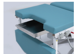
Foldable Section with Plastic Pan